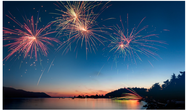
We were proud to be one of the sponsors of the Canada Day fireworks at Picnic Lake.

Sponsorship in the Surrounding Communities